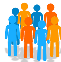
8 people attending