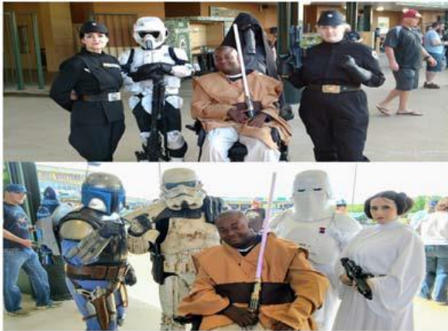
ABLE NRC Ambassador(s)