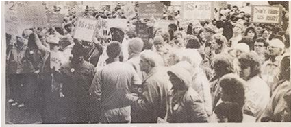
March on Trenton Galvanizes Advocates, Gains Broadbased Media Recognition